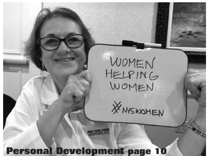
Personal Development page 10

NIKE (ISSN 0271-8391, USPS 390-600) is published quarterly in September, January, March/April and May by New York State Women, Inc. (formerly Business and Professional Women of New York State, Inc), 295 Weimar Street, Buffalo, NY 14206-3209. Subscriptions are a benefit of membership in New York State Women, Inc. Periodical postage is paid in Buffalo, NY and additional mailing offices.